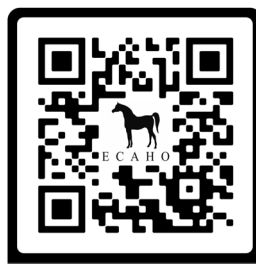
Rules for Conduct of Shows

Only ECAHO approved QR codes are allowed as they guarantee the latest version of the regulations and usage statistics. These QR codes can be downloaded from the ECAHO website.