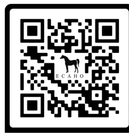
Rules for Sportclasses